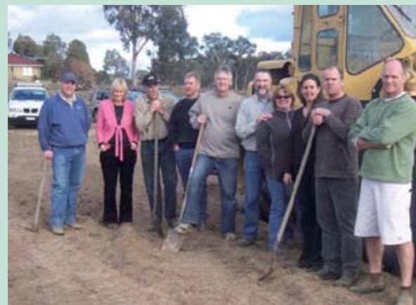
2. Then the drainage and earthworks started.