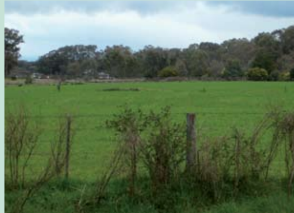
1. It started as a paddock.