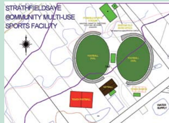
3. Soon two football ovals and three netball courts will be ready for use.